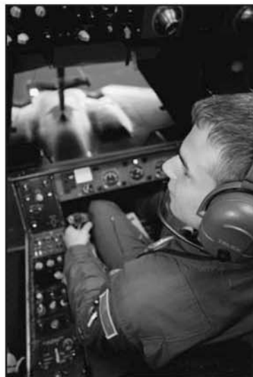
Aerial refueling from the tanker

The 393rd EBS continued to stay busy throughout its two-month deployment, taking part in the largest Pacific exercise since the Vietnam era, Valiant Shield, and the integration and maritime interdiction exercise Northern Edge.