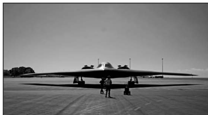
13 th Expeditionary Squadron in Australia

The 13th EBS continued the busy flying schedule established by its predecessors and took part in the first B-2 deployment on the continent of Australia.